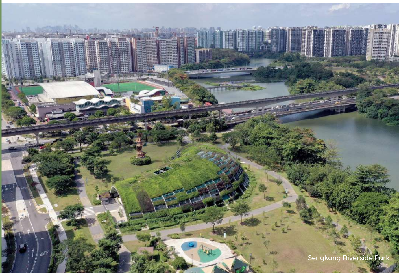
Sengkang Riverside Park

Our towns are planned to be liveable and self-sufficient, with easily accessible shops, health care, schools, community facilities and parks. Commercial nodes, industrial estates and business parks within or nearby the town, also help to provide nearer job opportunities for residents. The detailed planning and implementation of plans for each town is a joint effort of many government agencies.